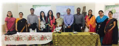
NPCI team with Parisar Asha NGO and school staff

NPCI has partnered with Parisar Asha NGO for "ECO TECH World school program" that is based on ESAL (Environmental Studies Approach towards Learning). It offers the students and teachers a means of growth in knowledge, learning skills, attitudes and values as part of overall improving quality of education. Paranjape Marathi Vidyalaya and Arvind Gandhabhir schools are been supported for this initiative by NPCI. This is a one year program where students will be trained in different aspects of learning in their regular syllabus with improved teaching methodology.