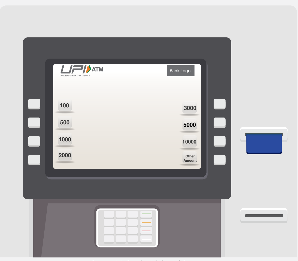
Screen-2A-Quick withdrawal Screen

Customer to select desired amount from the available amount (₹ 100, ₹ 500, ₹ 1,000 ₹ 2,000 ,₹ 5,000) or Enter the different desired amount from Other Amount option